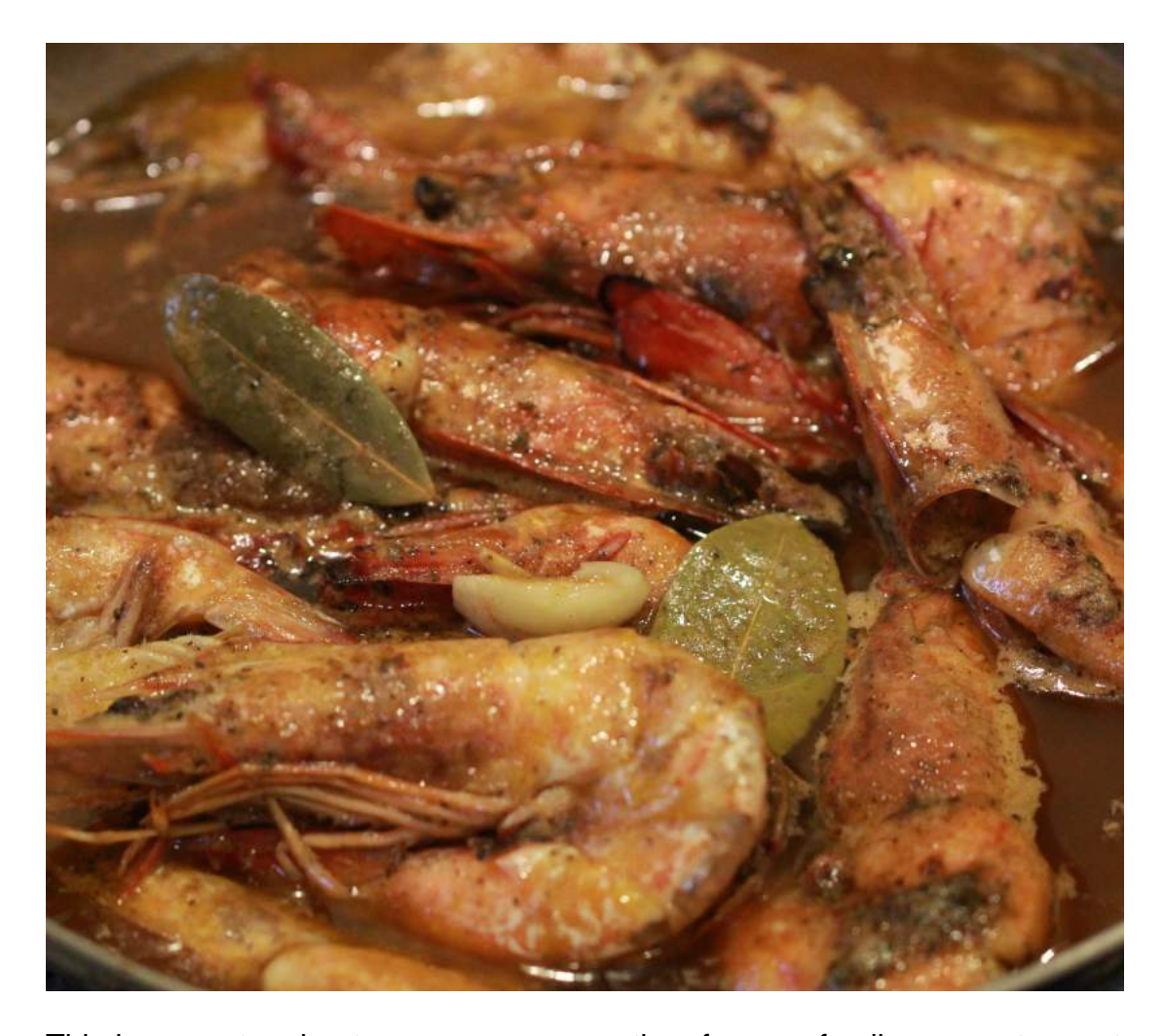
This is a great recipe to serve as an appetizer for your family or guests – get extra bread, as the butter sauce is very popular....